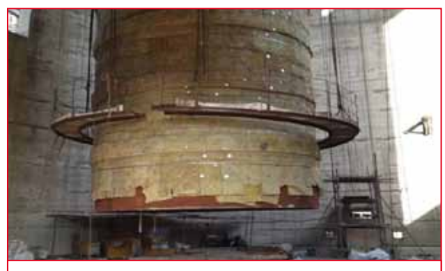
Flue Can Erection for Chimney, Sagardighi, West Bengal