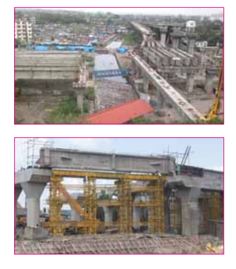
At another span at P33-P34 where 14 Girders were to cast, Trestle erection for I Girder Supporting was not feasible due to space constraints. The Span is over

Due to various length of I Girder & the transverse distance between two, I-girder is more varying from one end to another end. Due to this we were not able to complete the I Girder casting by one time erection of supporting arrangement for a single span. We have to go for erecting of two or three supporting arrangement at the same time for completion of I Girder in single span.